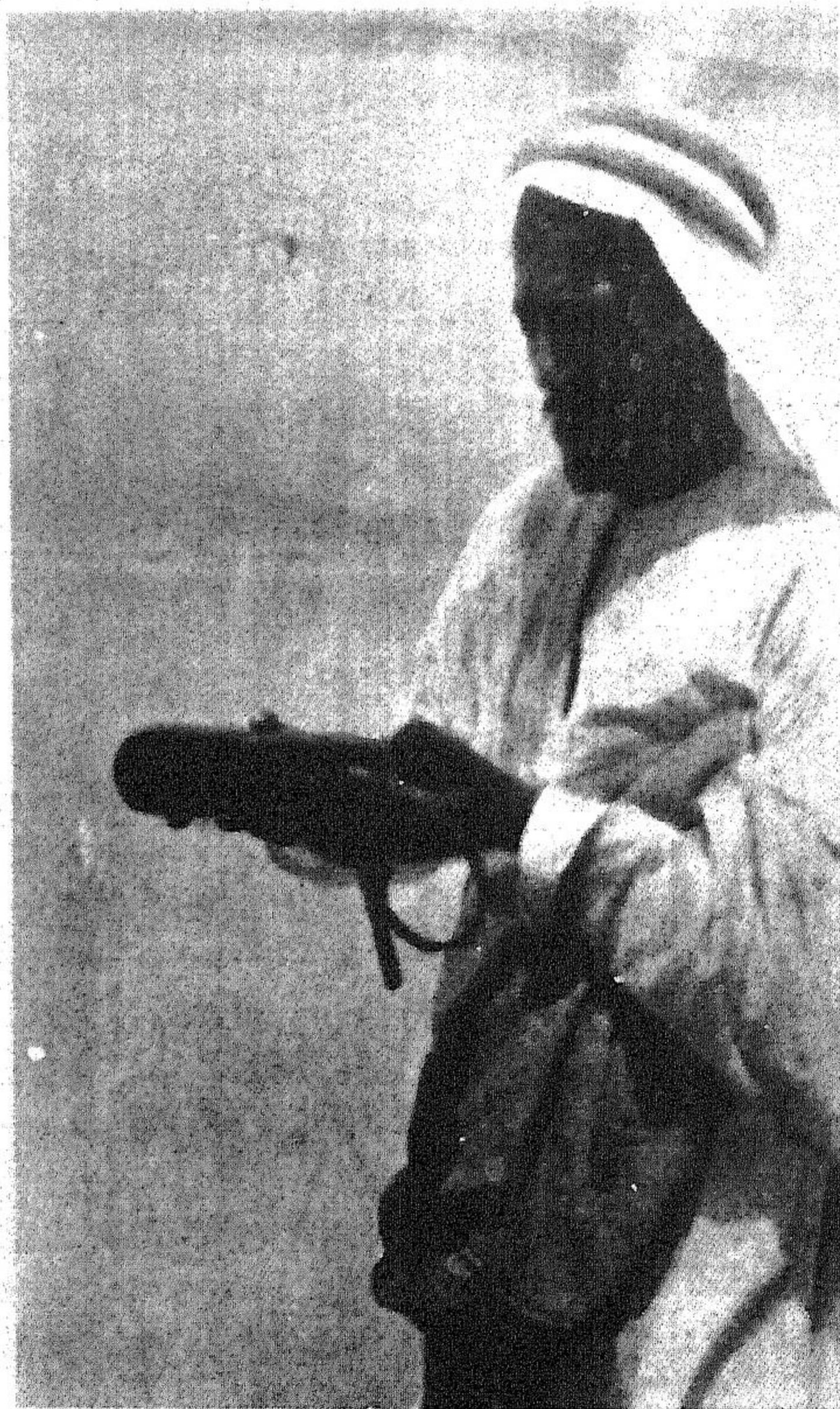
THE LARGEST PEARL OF THE 1927 SEASON, WORTH ABOUT £5,000.