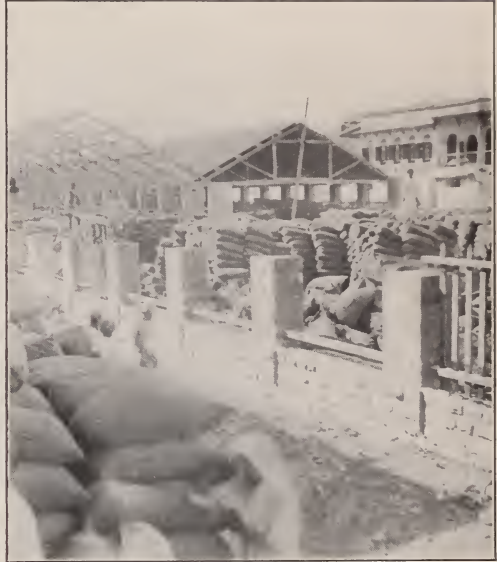
BIBLE SHOP AND THE CUSTOM HOUSE, BAHREIN.

2. THE BREAD OF LIFE AND THE BREAD THAT PERISHETH. —The above interesting photographs taken by Mr. D. Dykstra, startlingly illustrate the growing importance of Bahrein as a distributing center for bread. The picture on the right is that of the new custom house and warehouse being built by the sheikh, which is to cost 500,000 rupees, or about $170,000. It is intended especially for the storage of rice and grain at Bahrein, and even before the building is completed one can see how the space is utilized for the thousands of bags of rice from Rangoon and Calcutta, not only for the people of Bahrein but for Hassa and all the coast.