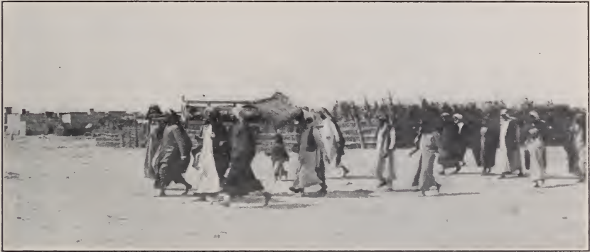
FUNERAL OF A PLAGUE VICTIM.

Every word of this ancient petition has rung in my ears during the last month: the result of plague is the loss of the breadwinner, and the loss of the breadwinner means famine. Plague—that grim terror that used to sweep over Europe, that has lately stricken down some sixty thousand people in Manchuria, and which in the month of March alone killed one hundred and thirty-one thousand people in India—plague is with us. All day long funerals have been taking place, and as the number of deaths increased, the usual rites and ceremonies of a funeral were cut short. Bodies were no longer washed prior to burial and, instead of being carried to the grave on a bier, were bundled