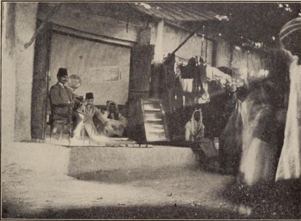
BIBLE SHOP ON MARKET STREET, KUWEIT

The Mission believes in so-called institutional work in the stations, and for several years past there has been a steady preparation for more systematized hospital and school work. The past few years have seen something in the way of a realization of these past plans. This has increased the cost of our station work considerably, and this will be