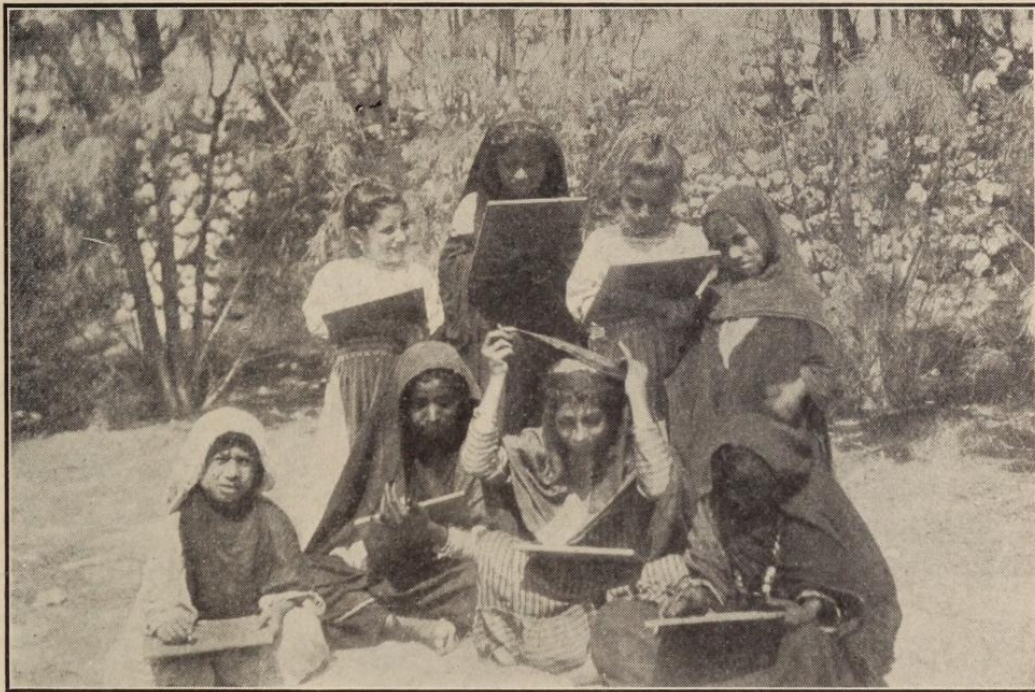
BAHREIN GIRL'S SCHOOL

The above items may be classed as missionary maintenance. The next item is $5.50 for book-shop rent. This secures an excellent location on the main street, where the books are displayed to the best ad-