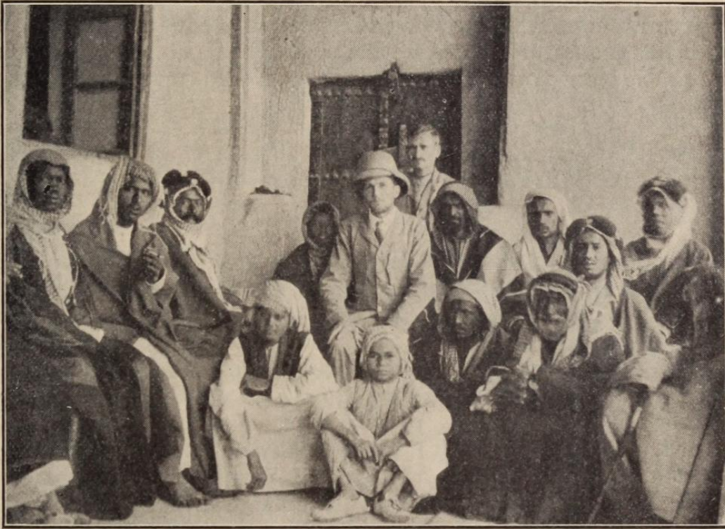
READY FOR THE DISPENSARY PREACHING AT KUWEIT

To my mind the greatest need just now is for a small, well-equipped laboratory in each hospital. I would make these complete enough for all clinical analyses, and for some scientific investigation which each doctor could carry on in his own hospital and station as he finds time. Each man has the opportunity constantly to see many unusual tropi-