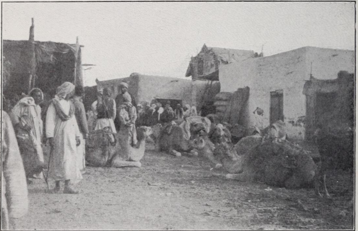
A CORNER IN DEBAI BAZAAR

it was the same. In Ajman we had to flee from the redoubtable camel ticks and live upstairs, and in Um el Gowein we subsisted on water saltier than any human being ought to be condemned to drink, except as a punishment for crime, but the hospitality of the people never failed. We drank coffee and tea in the houses of the rich and in the homes of the poor, and the cordiality of their unaffected welcome affords a thrill of joy even in memory. One day a call came for an emergency visit to Ras el Kheima and we started off in a small boat. As frequently happens, the wind which was favorable at first, died down, and was replaced by one exactly in our faces. So we disembarked and stopped for entertainment in a near-by village. The man who was